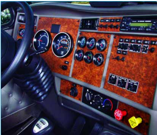
Left: The Standard Interior Right: Some of the available chrome trim options are shown.

Inside the W900L, it's easy to understand why so many professionals would prefer to turn the key on a Kenworth than any other truck. Luxurious hand stitched pleat-and-button upholstery and plush wall-to-wall carpet surrounds you with a rich-looking interior of unsurpassed comfort. The ergonomic "fit" of a W900L is about as intuitive as modern science can make it. The fully adjustable Air Cushion Premium Plus seats have been orthopedically contoured for lateral and lumbar support, while the flatter toe board angle and suspended clutch pedal reduce leg strain. Instruments are placed directly below and forward line of vision with vital vehicle control conveniently close at hand. These backlit non-glare gauges feature big, quick-to-read graphics and are logical, functional and quick to view—day or night.