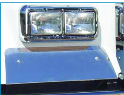
Below : Some of the available trim options are shown