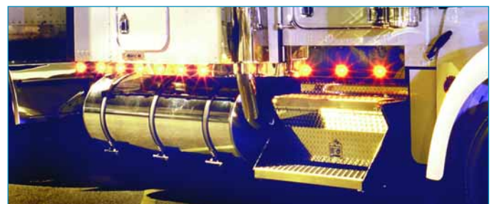
Above: Under Sleeper light bar option

Beyond the pure pleasure of owning the best, there's the reward of day-to-day dependability, mechanical integrity and longevity. Kenworth cabs are legendary for toughness. The Coil-Coated aluminum panels and a one piece fiberglass roof, supported by an aircraft-grade aluminum alloy frame, produce a lightweight yet durable cab that is virtually immune to rust. Thick bulkhead-type doors hang on continuous stainless steel piano hinges, not typical automotive hinges , and they fit snugly to become an integral part of the cab structure. Huckbolts hold all pieces together with a clamping force six times greater than rivets, so the cab is strong, tight and more rattle-free. Wiring and plumbing bundle together and mount high in the frame, safe from chafing, road salts and wash acids. Threaded steel shackle pins and bushings extend suspension life and improve steering. For longer life, radiator tie rods are mounted to frame, not the cab. There's much more, like using constant torque hose clamps that stay tight. It's this kind of attention to detail that keeps you moving ahead, day in and day out. You can see why Kenworth trucks bring more at resale than just about any other make that you can name.